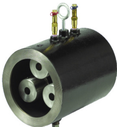
AT Wafer x Wafer

Automatic Flow Limiter • Wafer Connection • 400 WOG