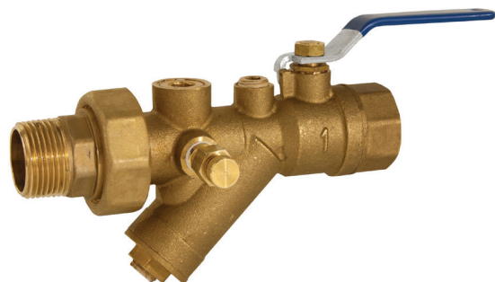
Terminator Y SS

Y-Strainer • Isolation Ball Valve • Union • 600 WOG • with Stainless Steel Trim