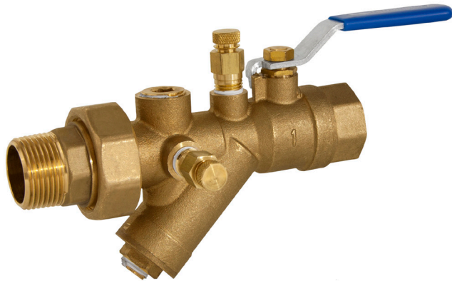
Terminator A SS

Automatic Flow Limiter • Isolation Ball Valve • Union • 600 WOG • with Stainless Steel Trim