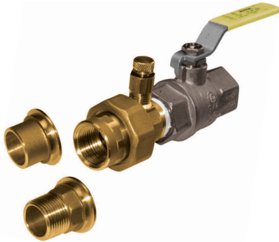
Terminator N SS